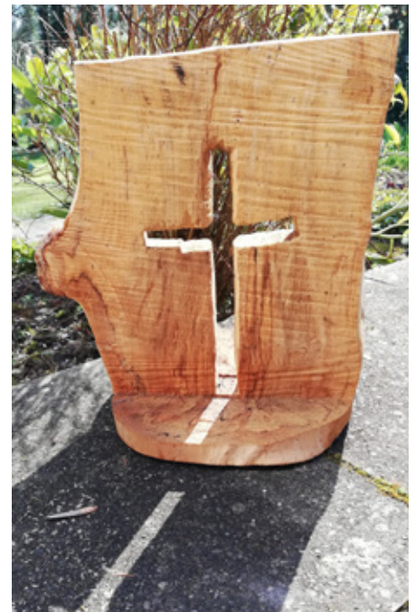
What does the empty cross or tomb mean to you?

Haiku is a form of Japanese poetry made of short, unrhymed lines. The most common is a three-line poem with a 5-7-5 syllable pattern. Write an Easter haiku where the first line describes how the women felt on the way to the tomb, the second line, how they felt at the tomb and the last line, how they felt as they returned to the disciples.